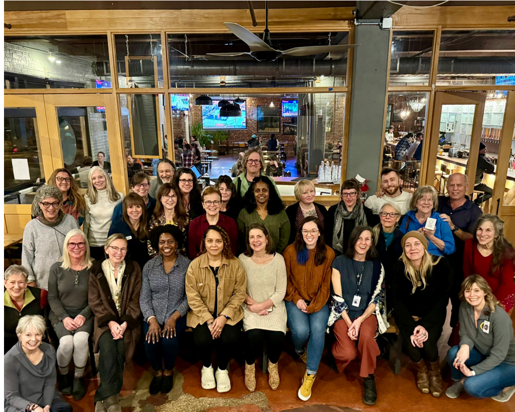
Death Over Drafts at Kardinal Hall