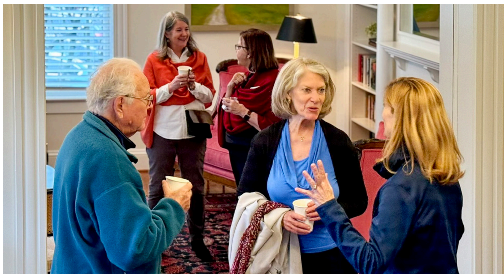
Scenes from our Hospice House tea and open house